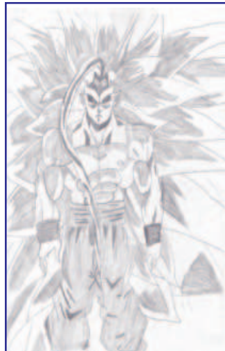
FAIYAZ AHAMED, CI.V