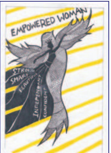
SURABHI SAI, CI.VI