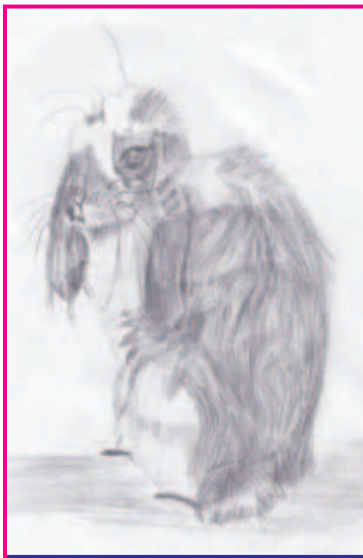
PRANAVI SREE, CI.VII